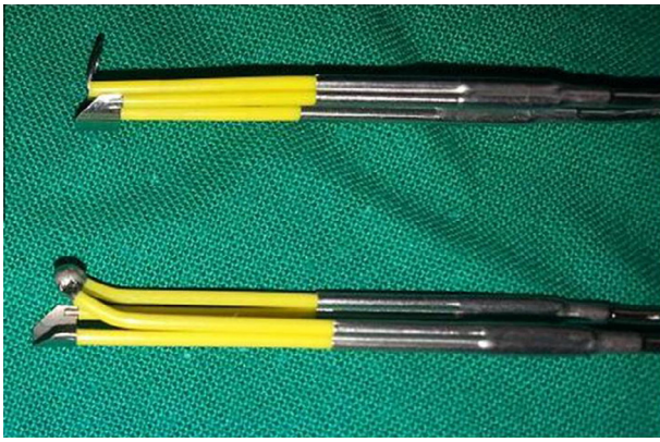
Figure 1 Cutting and vaporising bipolar loops.