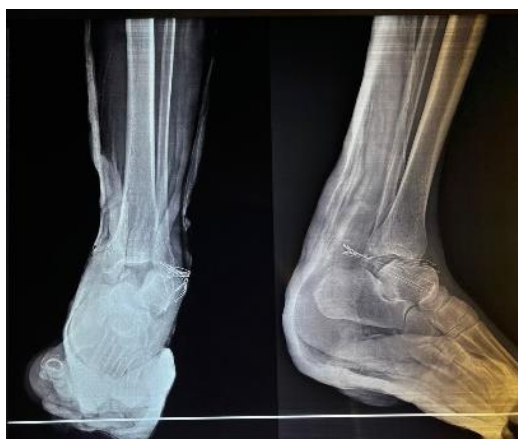
Fig. 1. X-ray of the right ankle showing pure anterolateral talus dislocation

H. At 55 years of age, the victim of an attack by a stone, had a direct point of impact on the right ankle while the foot was fixed, resulting in total functional impotence and severe pain. Clinical examination revealed a varus deformity of the foot, with the talus protruding anteriorly and medially, associated with a 4 cm anteromedial wound classified as type II according to Cauchoix and Duparc, with no downstream vascular-nervous disorders. X-rays of the right ankle showed complete anterolateral enucleation of the talus without fracture of the malleolar pincer (Fig. 1).