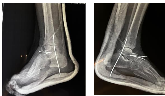
Fig. 3. Postoperative radiographic control

Surgery was performed as needed. After the wound was trimmed, exploration revealed soft tissue incarceration, preventing reduction of the talus (Fig. 2). The soft tissue was therefore released, followed by reduction of the talus maintained by a trans-calcaneo-talo-tibial pin and two scapho-talar pins. The reduction was stable and maintained by a cast boot for two months (Fig. 3), followed by rehabilitation. The functional result was satisfactory at the last follow-up, with no signs of radiological necrosis.