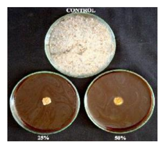
Fig. 3. Showing mycelial inhibition of U. indica bulb against Phomopsis azadirachtae