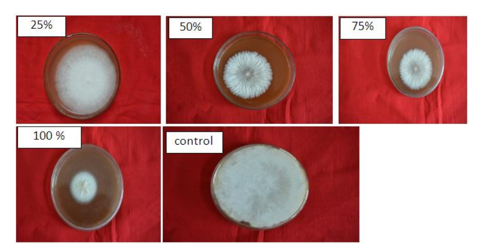
Fig. 2. Showing mycelial inhibition of U. indica bulb against Sclerotium rolfsii