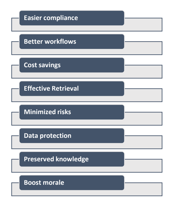
Fig. 2. Benefits of proper records management

Bunawan et al. [14], the importance of academic records can be categorized into three key areas: "Application", "Educational Development", and "Solving Issues". Also, Kane [15] outlines eight benefits of proper management of records as shown in Fig. 2.