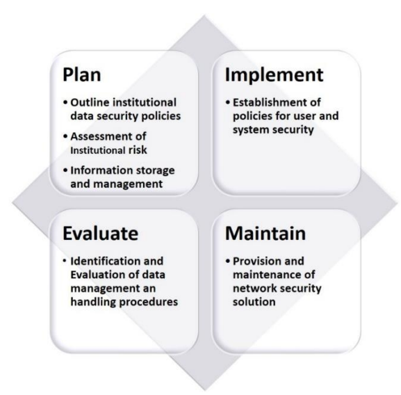
Fig. 3. The PIEM model for securing students' academic records systems

Educational institutions bear the responsibility of incorporating measures within their governance structure to effectively handle and diminish security risks associated with students' academic records. It is imperative to establish clear guidelines for data access, ensuring the secure dissemination of essential student information in decentralized manner Moreover. successful implementation of security measures necessitates a comprehensive understanding of potential threat sources and existing protective measures. This involves a consistent and thorough assessment regime, encompassing the management and accurate reporting of risks. Stakeholders within the educational domain must stay informed about evolving trends in data security, promptly reporting threats and risks that could compromise or distort user data. In Figure 3, we present a Plan-Implement-Evaluate-Maintain (PIEM) model designed for the strategic management of security threats concerning students' academic data within educational institutions.