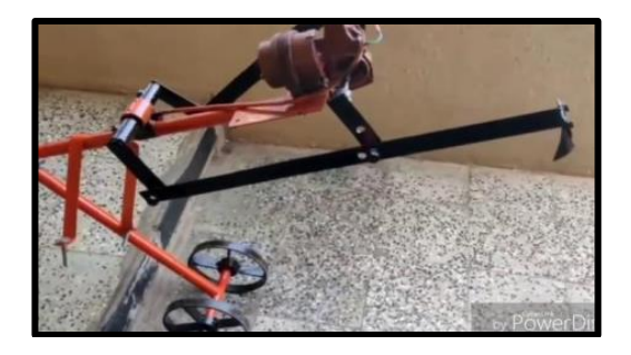
Fig. 6. Electric tiller and cutter

piece of equipment. The machine's dual functionality allows it to prepare the soil for planting and subsequently manage weeds effectively. It has been shown to efficiently manage weeds in multiple crop types without requiring significant manual intervention.