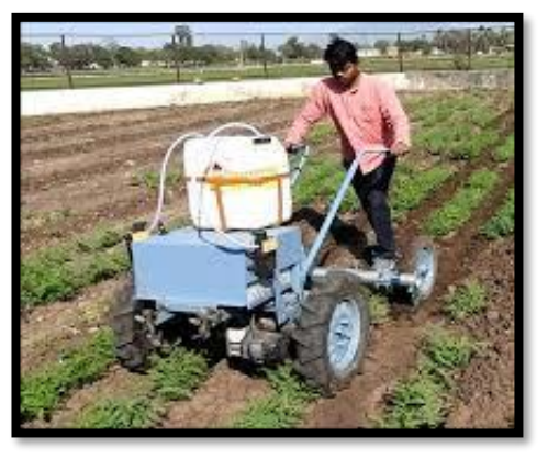
Fig. 7. Boom sprayer cum weeder

Boom Sprayer Cum Weeder: Singh et al. [1] designed a multifunctional machine that combines weeding and spraying functions, providing а versatile solution for crop management. This machine allows farmers to simultaneously manage weeds and apply pesticides or fertilizers, thus saving time and labour (Fig-7). The integration of these functions into a single machine enhances operational efficiency and reduces the overall cost of crop management as both the spraving and weeding is done by a single machine. The boom sprayer cum weeder is especially useful in large-scale farming operations where efficiency and cost savings are critical.