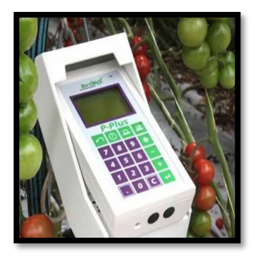
Fig. 12. Crop management machine

Integrated Crop Management Machine: Sudhir [9] developed a walking-type battery-operated boom sprayer cum weeder designed for integrated crop management. This machine combines the functions of weeding and spraying into a single unit, providing comprehensive crop care (Fig-12). It is equipped with adjustable nozzles and weeding attachments, allowing it to be customized for different crops and field conditions. Field evaluations have demonstrated its effectiveness in improving crop health and reducing labour costs, making it a valuable tool for integrated pest and weed management.