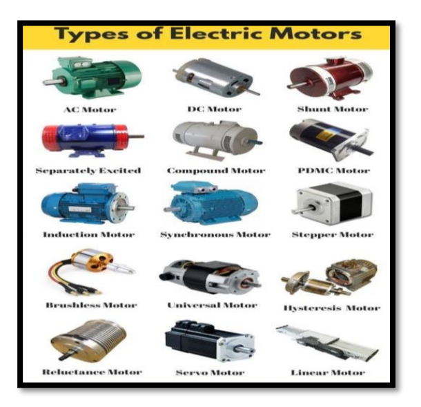
Fig. 4. Different types of DC motor

Battery Life: Battery life is a crucial factor in determining the efficiency and productivity of battery-operated weeding machines. The operational duration of these machines is directly influenced by the battery's capacity, energy consumption. and the machine's power requirements. Lithium-ion batteries are commonly used in these machines due to their high energy density, long cycle life, and low selfdischarge rates, which are essential for sustained agricultural operations [7].