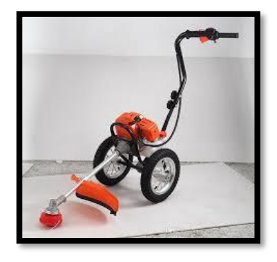
Fig. 9. Automated Wheel sprayer

Automated Wheel Sprayer and Weeder: Sinha et al. [8] introduced a multipurpose batteryoperated wheel sprayer and weeder. Designed for use in diverse agricultural settings, this machine integrates a weeding mechanism with a spraying system (Fig-9). It is particularly useful for small and medium-sized farms where versatility and cost-effectiveness are crucial. Field tests have shown its efficiency in weed removal and pesticide application, contributing to healthier crops and improved yields. The machine's ability to perform two essential farming tasks in one operation saves time and reduces labour costs [47].