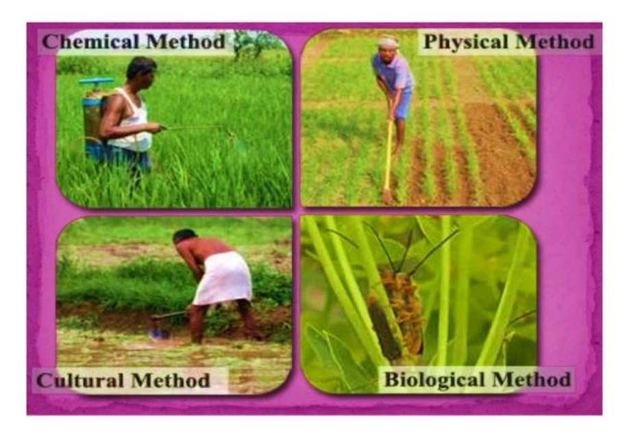
Fig. 1. Manual weeding techniques

Mukhuty et al.; J. Exp. Agric. Int., vol. 46, no. 9, pp. 385-403, 2024; Article no.JEAI.122282