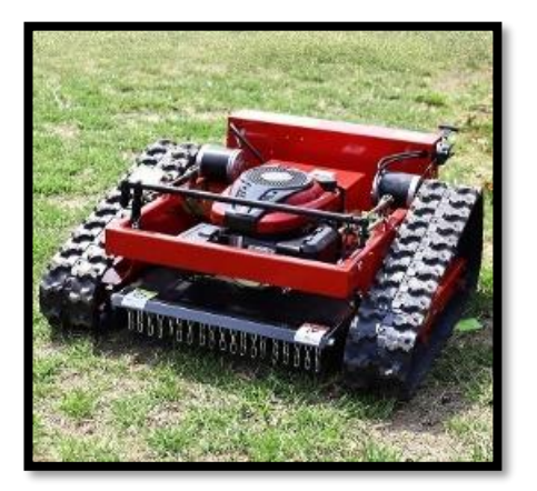
Fig. 10. Remote control weeder

innovative machine allows farmers to control the weeder remotely, reducing the need for manual labour and increasing operational safety. It is equipped with sensors that detect and navigate around obstacles, ensuring continuous and efficient weeding operations (Fig-10). The remote-control feature is particularly beneficial in challenging terrains and large fields, allowing for precise and safe weed management from a distance.