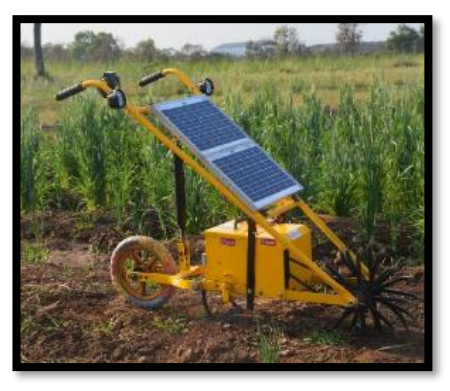
Fig. 14. Solar powered weeder

Solar-Powered Weeder: Patel et al. [48] designed a solar-powered weeder to enhance sustainability in agricultural practices. This machine uses solar panels to charge its battery, reducing dependency on external power sources and fossil fuels (Fig-14). It is equipped with rotary blades for effective weed removal and features an adiustable heiaht mechanism to accommodate different crop stages. The solarpowered weeder has shown promising results in field tests, demonstrating high weeding efficiency and extended operational time due to continuous solar charging.