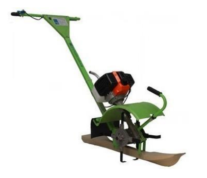
Fig. 5. Single row weeder

Single Row Weeder for Chickpea: The Single Row Weeder for Chickpea, developed by Nayak et al. [1], is specifically designed to enhance weed control in chickpea fields while minimizing crop damage. This machine is characterized by its high weeding efficiency, which effectively reduces weed density and preserves the integrity of the crops. It features adjustable weeding depths, allowing for customization based on varying field conditions and weed types. The weeder is powered by a rechargeable battery, providing portability and extended operation without the need for frequent recharging, making it both efficient and environmentally friendly. The design (Fig 5) also includes user-friendly controls, ensuring accessibility for small to medium-sized farms. Field trials, as noted by Yadav et al. (2007), have demonstrated the machine's effectiveness in significantly reducing weeds while maintaining the health and productivity of chickpea crops, making it a valuable tool for chickpea cultivation.