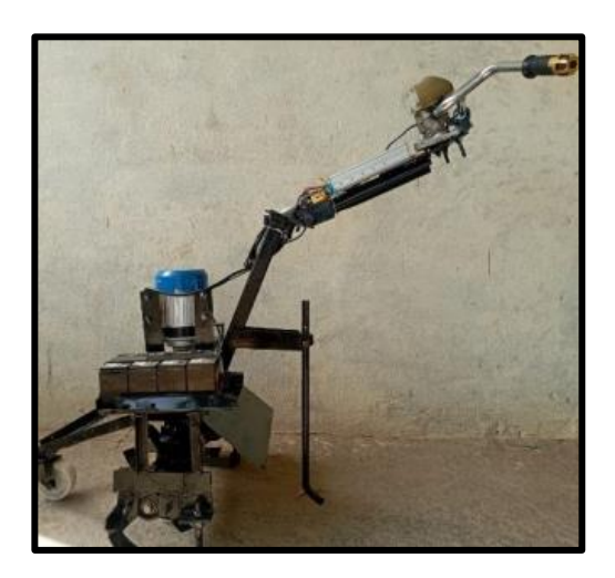
Fig. 11. Manual weeder

design is user-friendly, ensuring that it can be used effectively with minimal training, which is a significant advantage for individuals who may not be experienced in handling agricultural equipment.