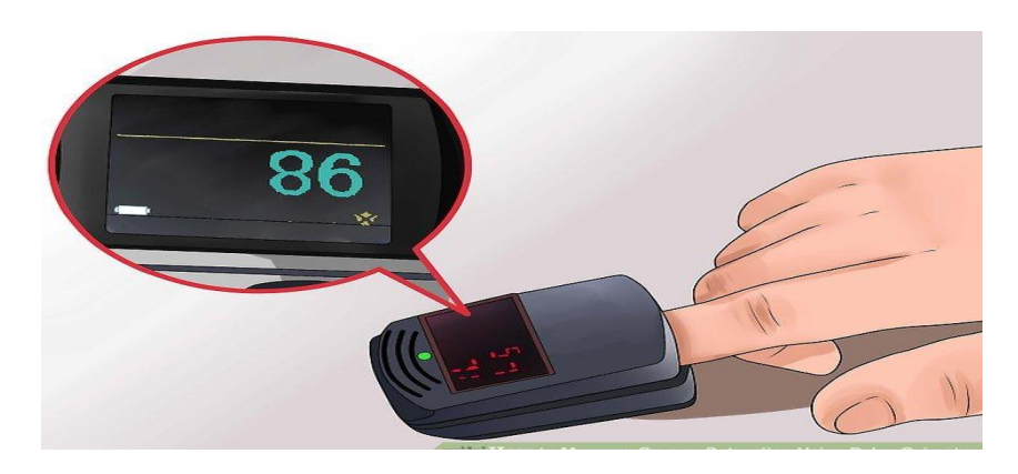
Fig. 5. Pulse oximeter [103]

Aroutiounian; JAMMR, 34(21): 36-47, 2022; Article no.JAMMR.86696