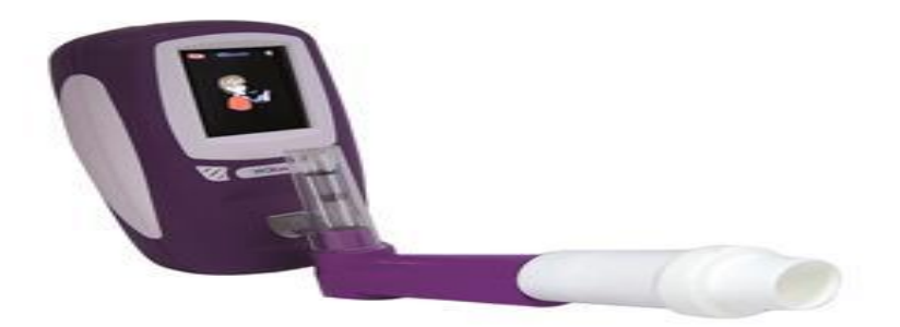
Fig. 3.BedfontNObreathFeNO Monitor [23]

Fig. 2. Siemens device for measuring the amount of nitrogen monoxide