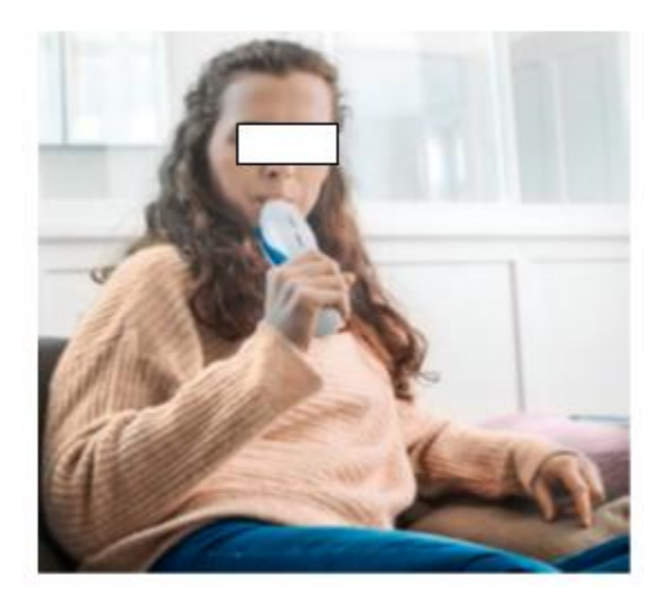
Fig. 4.small-size devices for measuring the amount of nitrogen monoxide

"Exhaled breath of patients with pulmonary arterial hypertension (PAH) had raised concentrations of 2-nonene, 2-propanol, acetaldehyde, ammonia, ethanol and pentane