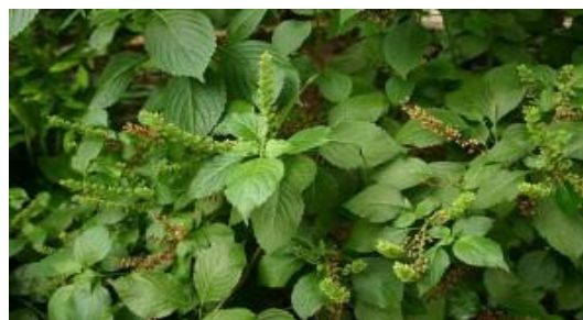
Fig. 1. Ocimumgratissimum plants

population, particularly in the developing countries is relying on herbal remedies for the treatment of various endemic health problems [14]. This of course may be for reasons of cost, availability, accessibility, culture and effectiveness. Research scientists have of late formed an alliance with traditional herbal practitioners as a means of getting first hand information on the medicinal uses of these plants for the purpose of verifying such claims scientifically. In most cases the validity of such claims usually leads to the development of new and pure substances for the treatments of diseases [15]. Thus the interest in herbal medicine is in no way surprising. Of much concern however is the manner in which these herbal preparations are taken without proper information on their possible deleterious effects. It is established that most plants are rich in numerous phytochemicals [16], some of which may produce systemic toxicity when introduced into the body at concentrations beyond tolerable limits. Several plants are currently being studied