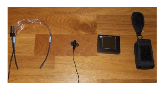
Fig. 1. SEBE equipment for NPP workers: Subcam on glasses, microphone, camcorder and bag

is wide enough to capture both hands interactions and faces of people.