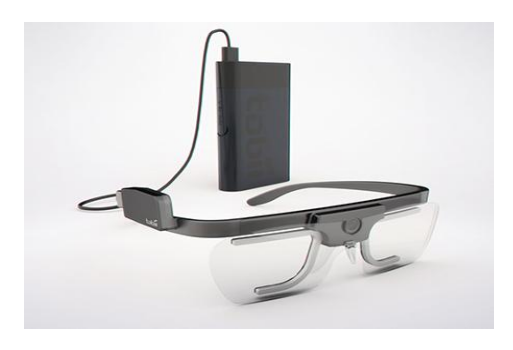
Fig. 3. SEBE equipment for French Air Force pilots: TOBII glasses 2 with external battery (the external battery may be withdrawn, limiting the autonomy to 120 minutes)

The SEBE equipment was eye-tracking system: TOBII glasses 2 with a 160-degree lens for frontal camera (1920 x 1080 pixels), 4 eye camera, integrated microphone, external battery (130 x 85 x 27 mm). The tracking technique was corneal reflection, binocular, dark pupil tracking.