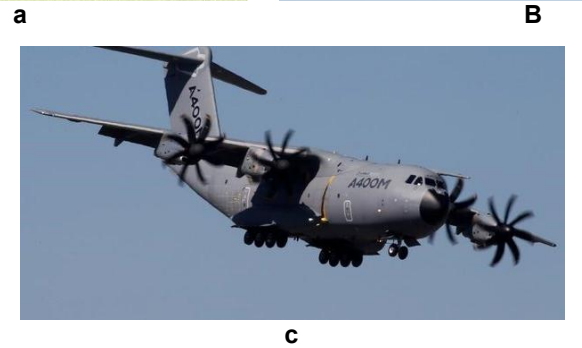
Fig. 7. Types of planes used by French Air Force for training: a) Cirrus, b) Alpha jet, c) A400M

This study received ethical approval of the Ethics Committee of the Dept. of Social Psychology of the London School of Economics (London, UK).