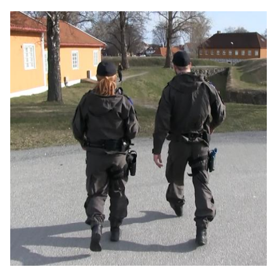
Fig. 6. Policemen at the Norwegian Police University College (PHS, Norway) involved in an outdoor intervention