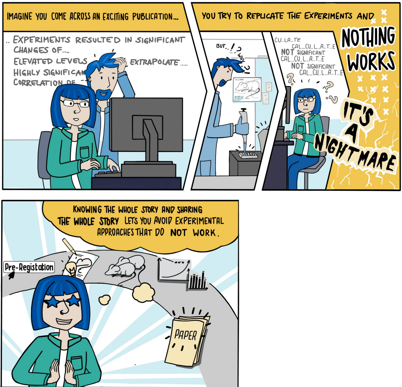
Fig 1. The ASR. ASR, Animal Study Registry.

https://doi.org/10.1371/journal.pbio.3000463.g001