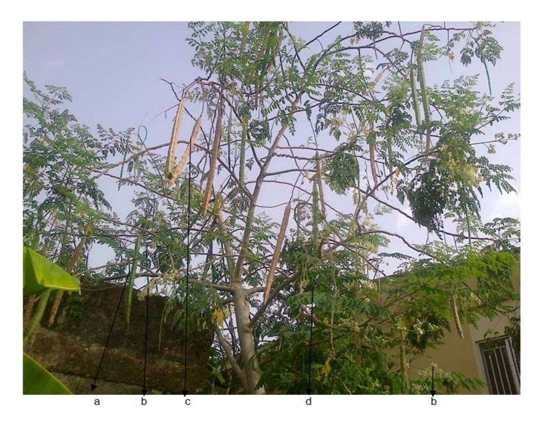
Fig. 1. M. oleifera Tree (a – immature seed pod; b – flower; c – matured seed pod; d – leaves)

Research Farm, Ile-Ife, Nigeria between February and March 2014. The identification was done at the herbarium of the department of botany, Obafemi Awolowo University. The leaves were harvested green, washed and dried at 45℃ to a constant weight immediately after harvest. The matured seeds were dehusked manually and further dried at 45°C for 4 h. Drying of the leaf and seed was done using a locally fabricated hot air dryer. The leaves and seeds were dry milled to flour separately using Marlex Excella dry mill (Marlex appliances PVT, was packaged Daman). Each in air tight polyethylene nylon and stored at temperature (27±2℃) further room for analysis.