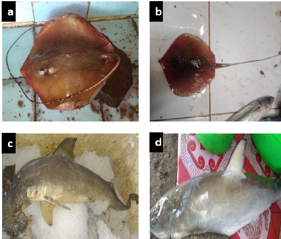
Fig 2. Sharks and Ray Observed at the Market. Freshwater Stingray ( Urogymnus dalyensis ) (a-b), hammerhead shark ( Sphyrna zygaena ) (c), Blacktip Shark ( Carcharhinus limbatus ) (d)

*FM: Fish Market; PM: Pangandaran Market; PAM: Parigi Market; BS: Bojong Salawe; CM: Cijulang Market