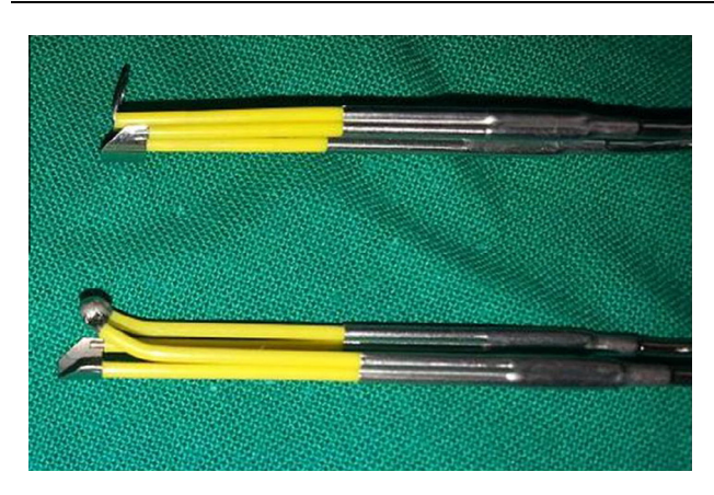
Figure 1 Cutting and vaporising bipolar loops.