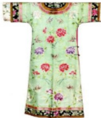
Figure 9. Qipao

https://new.qq.com/omn/20171204/20171204A0VIOB.htm 1