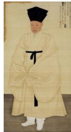
Figure 16. Religious Clothing