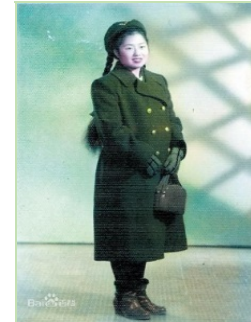
Figure 3. Lenin coat

https://shanghaiist.com/2015/12/11/a_century_in_chinese_womens_fashion/