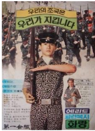
Figure 11. Drill Uniform

It is the political nature of the international conference or state visiting itself giving the political attributes to clothes. These politicians, as the main participators of the conference, wear these clothes for political requirement, while general public does not need to. That is why civic national identity ought to be understood in the view of the government in this section. Figure 14 was from the APEC conference held in Seoul, 2005. Clothing worn by leaders was the Korean traditional Hanbok made of totally Korean native silk fabrics. Pine trees and bamboo representing loyalty, nobleness and wise was adopted in the design. The selection of Korean political color blue together with the traditional Hanbok are examples of how Korean civic national identity was showed via the adoption of ethnic elements as well.