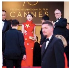
Figure 5. Use of Chinese Flag element of fashion design

http://blog.naver.com/PostView.nhn?blogId=china_lab&logNo=221142070693