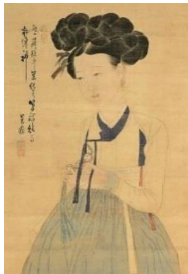
Figure 15. Hanbok