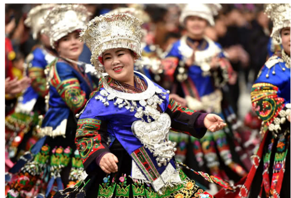
Figure 8. Ethnic Minority