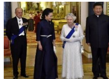
Figure 6. Chinese first lady Peng Liyuan

http://blog.naver.com/PostView.nhn?blogId=nihaozhongguo&logNo=221009837689&parentCategoryNo=&categoryNo=76&viewDate=&isShowPopularPosts=true&from=search