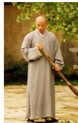
Figure 10. Religious Clothing