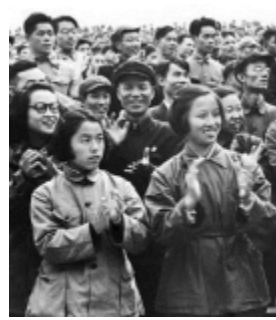
Figure 2. Mao's suit