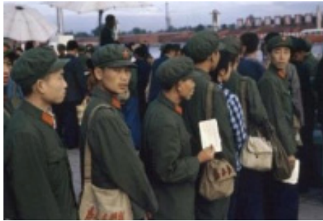
Figure 1. Chinese Military Uniform