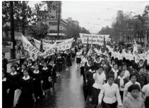
Figure 12. School Uniform