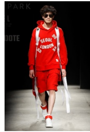
Figure 13. D-Antidote 2016 F/W