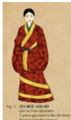
Figure 7. Han Ethnic

Invisible-spiritual ethnic elements are mainly based on the essential religious belief of one nation or ethnicity, which is a feeling that reflects the core of the religious philosophy. For example, in the oriental philosophy, the beauty of restraint and nature in Taoism, the beauty of simplicity and hideaway in Buddhism and the beauty of order and moderation in Confucianism (Seo & Kim, 2008). These elements or features are all derived from religious philosophy, the understanding and application of which does embody the ethnic national identity. In the expression of clothing, the three religions are different from each other but the similar features cannot be covered up. Unconstructed forms, restraint color and natural materials, characteristics of oriental religious philosophy could be concluded as hiddenness, simplicity, cleanliness and non-structure (Seo & Kim, 2008) (Figure 10).