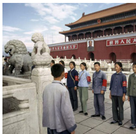
Figure 4. Red Guard Style

http://kr.people.com.cn/20390/203281/8618386.html