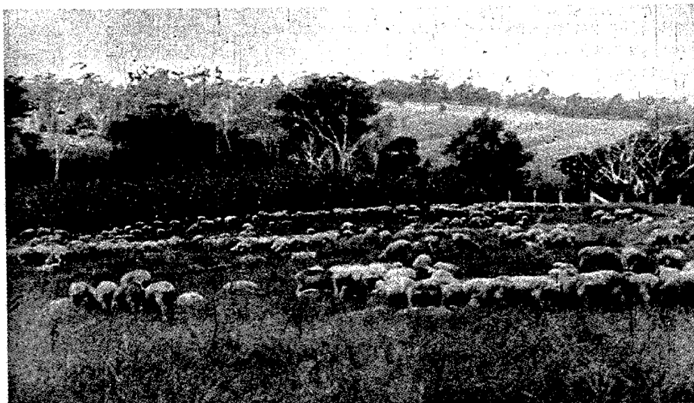
Figure 2. The Breaking of the Drought (1920). From lack to plentitude

This idea during the 1920s was supported by the ideal of “Australia Unlimited” which had the intention of providing “A Million Farms for a Million Farmers” (Alomes & Jones, 1991, p. 182). Some Australians thought