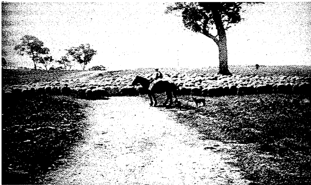
Figure 3. A Girl of the Bush (1921). A few trees, a solitary horseman and a multitude of sheep, rough tracks, and burning white roofs, symbolizing wealth, human cultivation and control

In these films, characteristic and impressive shots show a station in a wilderness, a few (or a lone) tree(s), a solitary horse(wo)man and a multitude of sheep, rough tracks, and burning white roofs, which symbolize wealth, human cultivation and control (Figure 3). This can be seen in A Girl of the Bush (1921), in The Hayseeds (1933) and in The Squatter's Daughter (1933). As Tulloch argues, the cultural icons support this comforting notion of purpose and control. The theme of human dominance and control is clearly demonstrated by the competent pioneer on the edge of civilization. This is the mark of progress (Tulloch, 1981, pp. 139-140). This “progress” and “control” are achieved by the victory of human culture over untamed nature. For example, in The Squatter's Daughter , the opening shots show the “achievements” of one and a half centuries of white European settlement in the Monaro in New South Wales. The large flock of sheep, “surely the largest ever assembled anywhere in the world in front of a camera”, is proudly paraded before the eyes of the viewer (Hoorn, 2007, p. 69). Produced for international audiences, the film shows the basis for the creation of the wealth which supported the European development of Australia. The image was embedded within the self-consciousness of a national “culture” (Note 1) (Hall, 1977, p. 78).