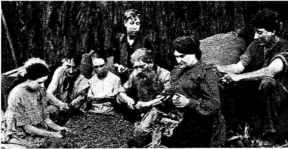
Figure 1. On Our Selection (1920). Rudd's family pulling the ripened corn and shelling the corn with their hands

the family's toil, achieved through the strength of their efforts to turn the wilderness into a humanized and civilized land.