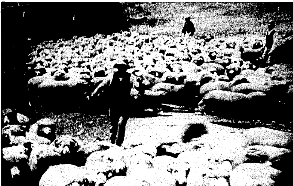
Figure 4. A Girl of the Bush (1921). Abundant sheep: a sign of civilized domestication and “progress”

“culture” and as the “alibi” of the rider’s power is much too forced. The fact that the tree has been extracted from its landscape and is visually impressive is not a plausible reason for seeing it as representing “culture”. But his opinion is convincing in that this image symbolizes the fact that “culture” controls and dominates “nature”, and suggests that the horse(wo)man becomes a real Australian (wo)man in the cultural domain only after he / she is shown to have been successful in controlling nature. In this image, the abundant sheep are a sign of civilized domestication for the use of humans, and more specifically, a sign of the labour undertaken by the horse(wo)man. The rider, sitting comfortably on the horse and watching a crowd of sheep, signifies a pause in the drive to master the land and make it produce wealth. This image is a visual expression of this description of the popularity of paintings on the theme of pioneers, displayed in the Melbourne’s Centennial International Exhibition in 1888: “...The unknown wilderness has been made to produce coal and gold, wool and wine...Out of the barren earth there has come wealth, out of the handful of settlers a great people” (Astbury, 1985, p. 130). This image links the legacy of the nation’s pioneering image (as the provider of progress, prosperity and civilization out of a “wilderness”) in the past to the abundance of the present, to the creation of this material achievement (Figure 4).