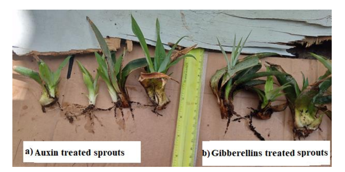
Plate 6. Site of origin of initial roots in hormone treated pineapple crown leaf

Eunice et al.; J. Agric. Ecol. Res. Int., vol. 25, no. 1, pp. 97-107, 2024; Article no.JAERI.111586