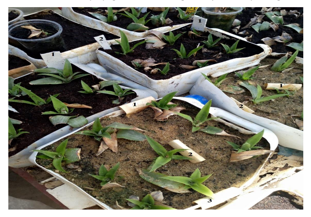
Plate 5. Transplanted and three tagged propagules per plot for data collection