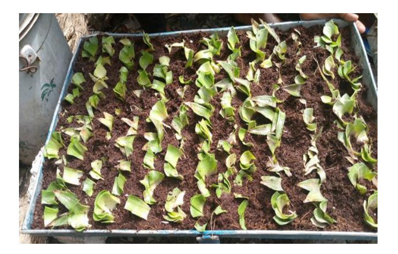
Plate 2. Propagation tray, with coir media and planted crown leaf cuttings

Eunice et al.; J. Agric. Ecol. Res. Int., vol. 25, no. 1, pp. 97-107, 2024; Article no.JAERI.111586