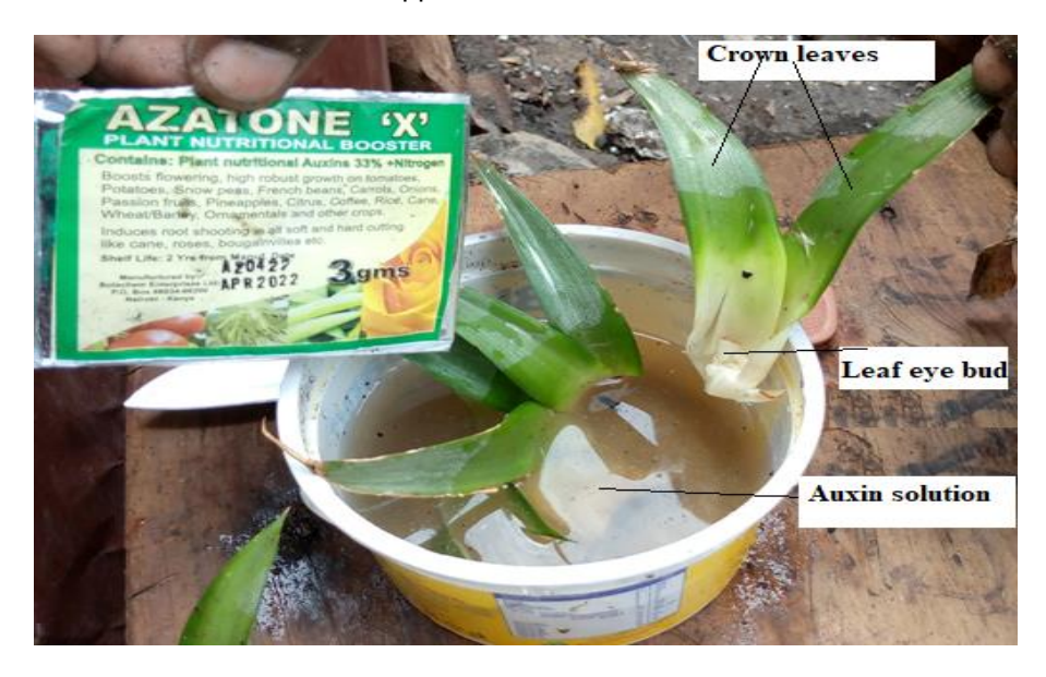
Plate 1. Treatment of individual crown leaves (with a bud) with auxin hormone

At initial stages, the treated crown leaves were raised in large metallic propagation trays containing coir media to facilitate selection of healthy "germinating" pineapple propagules from crown leaf buds (Plate 2).