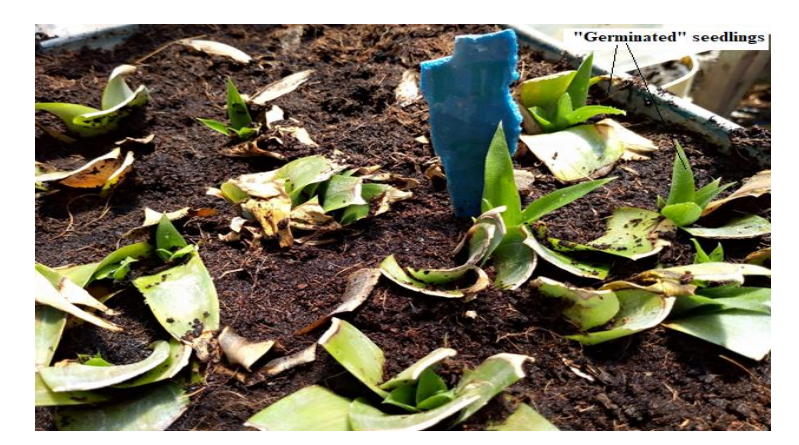
Plate 3. One-month old germinated pineapple propagule seedlings

Eunice et al.; J. Agric. Ecol. Res. Int., vol. 25, no. 1, pp. 97-107, 2024; Article no.JAERI.111586