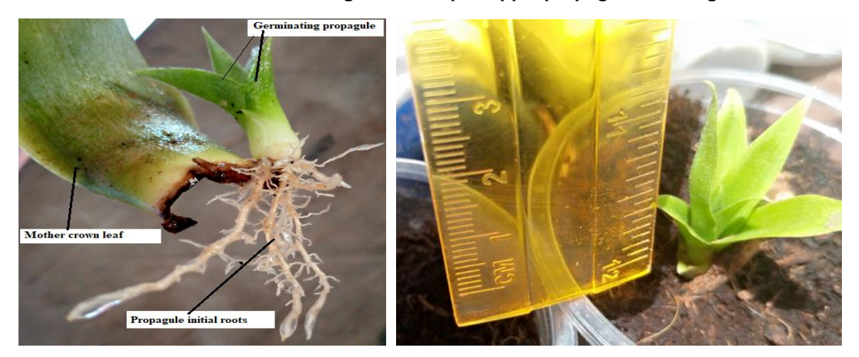
Plate 4. Rooted propagule at 3 cm in height ready for transplanting