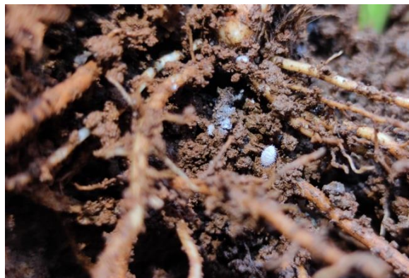
Fig. 5. D. brevipes colonies on the rhizosphere of sweet flag