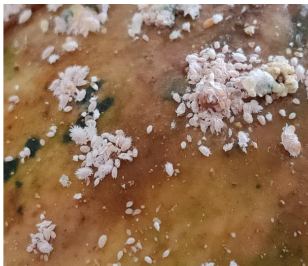
Fig. 1. Artificial rearing of D. brevipes on pineapple for mass multiplication