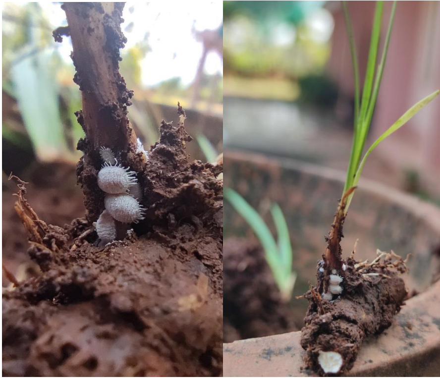
Fig. 2&3. of D. brevipes attack on sweet flag