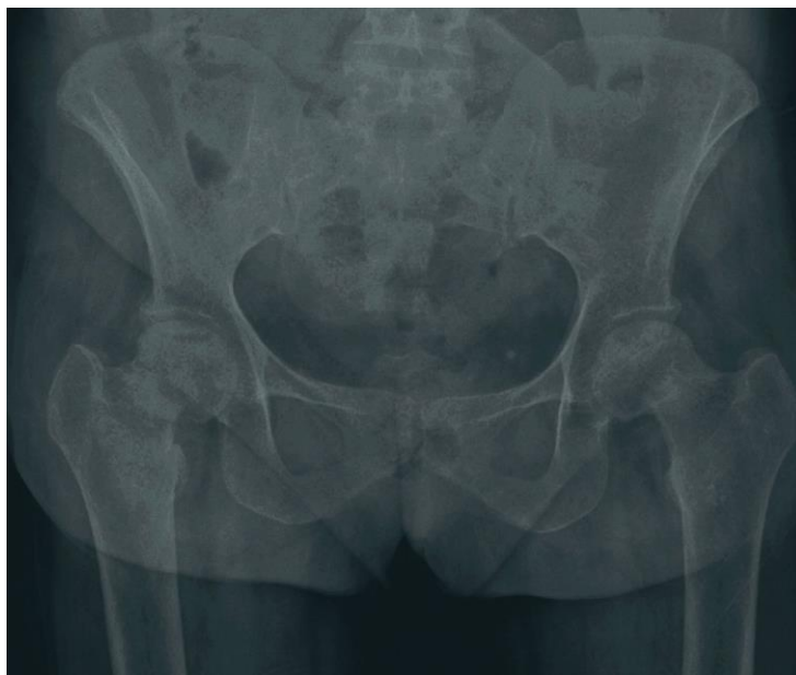
Fig. 1. A pelvic X-ray demonstrating widespread osteopenia in femoral neck

hand above shoulder level. The patient was bedridden since 2 months unable to do work by herself. Patient was started on TLD regimen 8 months ago when the CD-4 count was 184 and then started to develop knee pain. On examination the patient was conscious and coherent, temperature-afebrile, blood pressure 120/70mmhg, pulse rate 82 beats per minute, cardiovascular system had S1 S2+, respiratory system had bilateral air entry, per abdomen was soft, oxygen saturation was 98 percent, central nervous system had no abnormal defects and body mass index of 28.1kg/m 2 . The laboratory findings were the haemoglobin level was 12.8 gm/dl, white blood cell count was 4.8 k/cumm, red blood cell count was 4.56*10 6 /cumm, platelet count was 1.78 lk/cumm, CD4 count 420, T score 3.3, Z score 2.9, serum calcium was 9.8, vitamin B12 was 258, vitamin D 23.7. The ultrasound showed the patient has a small kidney with grade 3 recurrent pyogenic cholangitis (RPC). X ray was conducted in the lumbar spine (0.631g/cm 2 , T- SCORE -2.7) and femoral neck (0.804 g/cm 2 , T -score -2.5) revealed reduced bone mineral density. Based on the complaints and the laboratory findings the patient was diagnosed with tenofovir induced osteopenia. The treatment given to the patient was tablet abacavir 300 mg per oral twice a day, tablet lamivudine 150 mg per oral twice a day, tablet dolutegravir 50 mg per oral twice a day, tablet calcium per oral once a day and tablet multivitamin/b-complex per oral once a day.