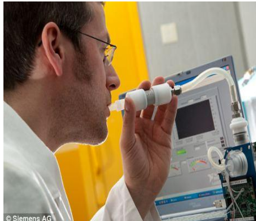
Fig. 2. Siemens device for measuring the amount of nitrogen monoxide