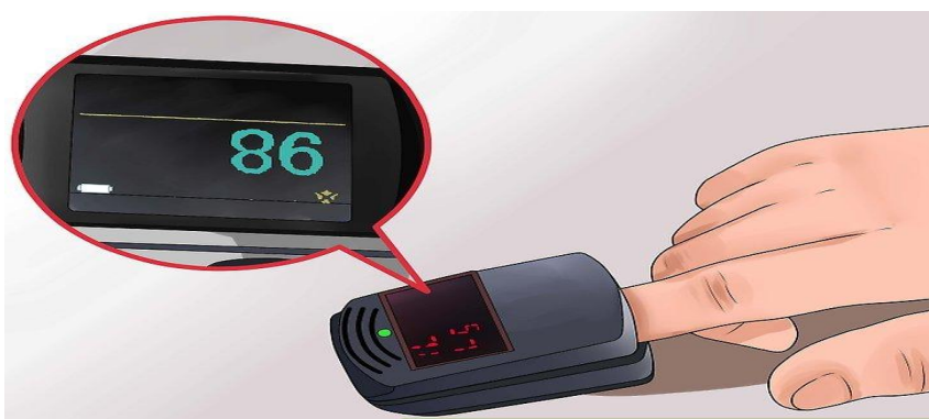
Fig. 5. Pulse oximeter [103]

A device contains a light source, light detector, and microprocessor, which compares and calculates the differences in oxygen-rich versus oxygen-poor hemoglobin. One side of the probe contains a light source with two different types of light: infrared and red. These two types of light are transmitted through the body's tissues to the light detector on the other side of the probe.