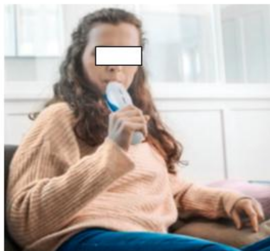
Fig. 4. small-size devices for measuring the amount of nitrogen monoxide

“Exhaled breath of patients with pulmonary arterial hypertension (PAH) had raised concentrations of 2-nonene, 2-propanol, acetaldehyde, ammonia, ethanol and pentane