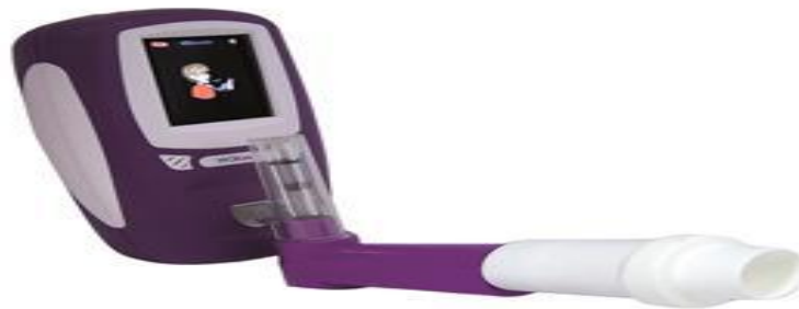
Fig. 3. BedfontNObreathFeNO Monitor [23]