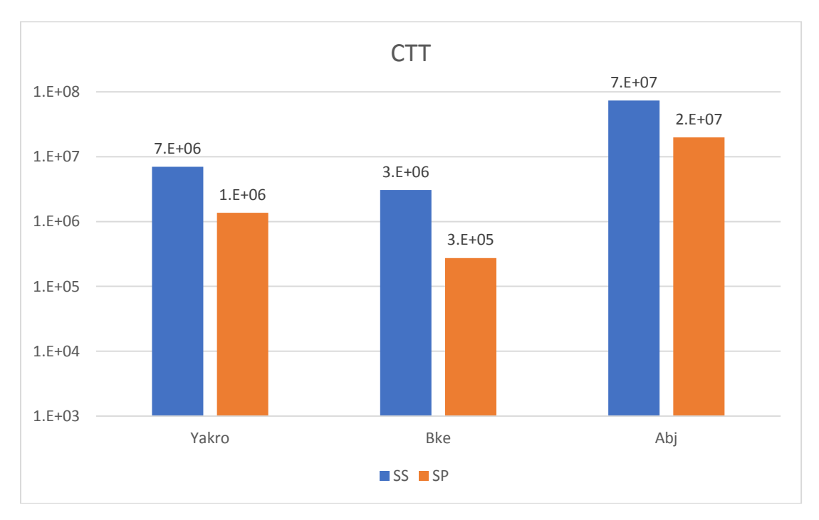
Fig. 3. Average load of faecal coliform pollution level by season (dry (SS) and rainy (SP) seasons) in urban agglomerations Abidjan (Abj), Bouaké (Bke) and Yamoussoukro (Yakro)