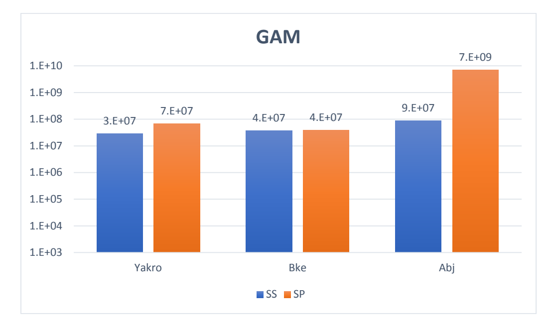
Fig. 2. Average load of the level of pollution of mesophilic aerobic germs according to the seasons (Dry (SS) and rainy (SP) seasons) in the urban agglomerations Abidjan (Abj), Bouaké (Bke) and Yamoussoukro (Yakro)

cfu/100mL, 6x10^6 , 6x10^5 in the rainy season, 3x10^6 cfu/100 mL, 6x10^5 cfu/100ml in the dry season. Average loads of enterococci were significantly higher in the rainy season than in the dry season.