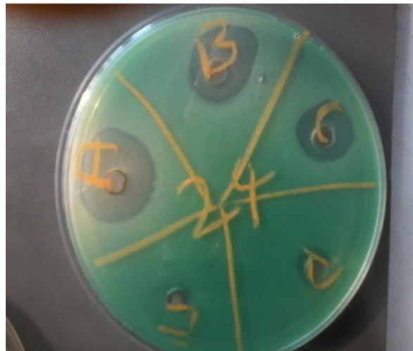
Fig. 2. Agar well diffusion method showing the diameter zones of inhibition of cocoa pod husk at different concentrations against an isolate of Pseudomonas aeruginosa

Thus, the antipseudomonal effect of the cocoa pod husk extract against the organism was experienced at 150mins after the introduction of P. aeruginosa into the extract suspension of 62.5mg/ml concentration. This indicates that, the lower the concentration of Cocoa pod husk extract, the longer the time taken for elimination to occur.