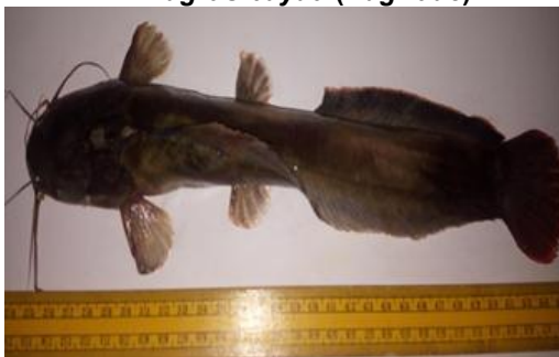
1C-Clarias anguilaris (Clariidae)