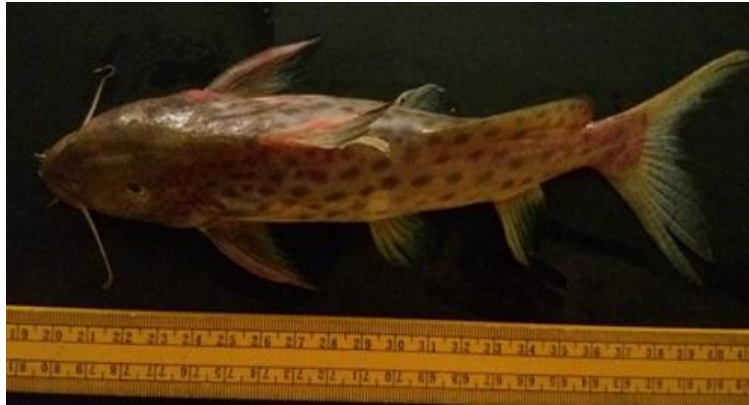
1E-Synodontis nigrita (Mochokidae)