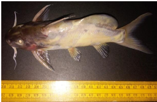
1A- Bagrus bayad (Bagridae)

Note: (●) represent presence of fish species in a station