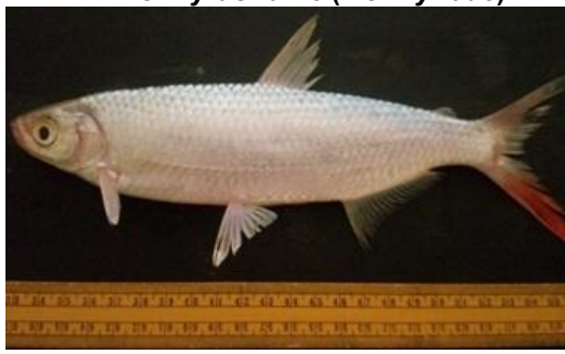
1D-Hydrocynus forskalii (Characidae)