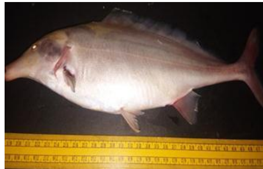
1B-Mormyrus rume (Mormyridae)