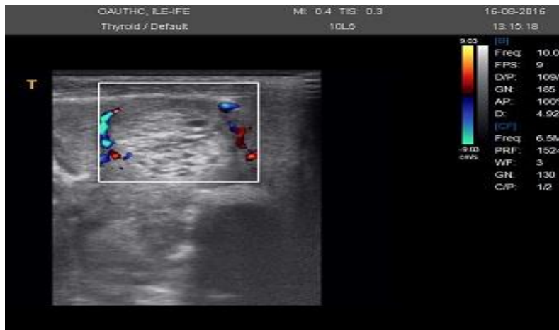
Fig. 4. Transverse plane, B mode and colour Doppler USS showing a smoothly margined wider than tall hyperechoic, spongiform nodule with perinodular vascularity