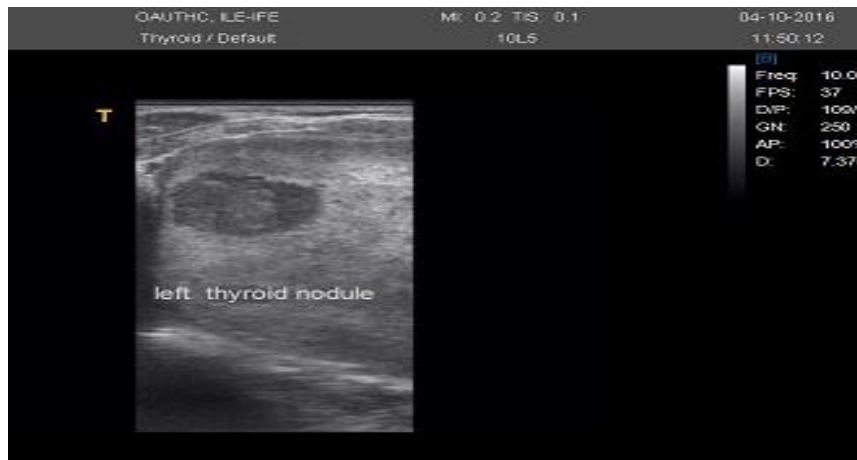
Fig. 1. Longitudinal plane B mode ultrasound scan of the thyroid gland showing an oval shaped, smoothly margined, wider than tall hypoechoic nodule