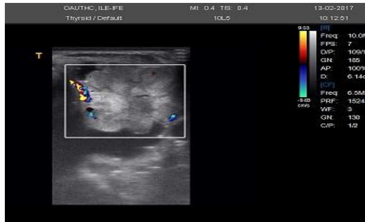
Fig. 3. Transverse plane, B mode and colour Doppler USS showing an ill-defined, irregularly margined, taller than wide, predominantly solid hyperechoic nodule with perinodular vascularity