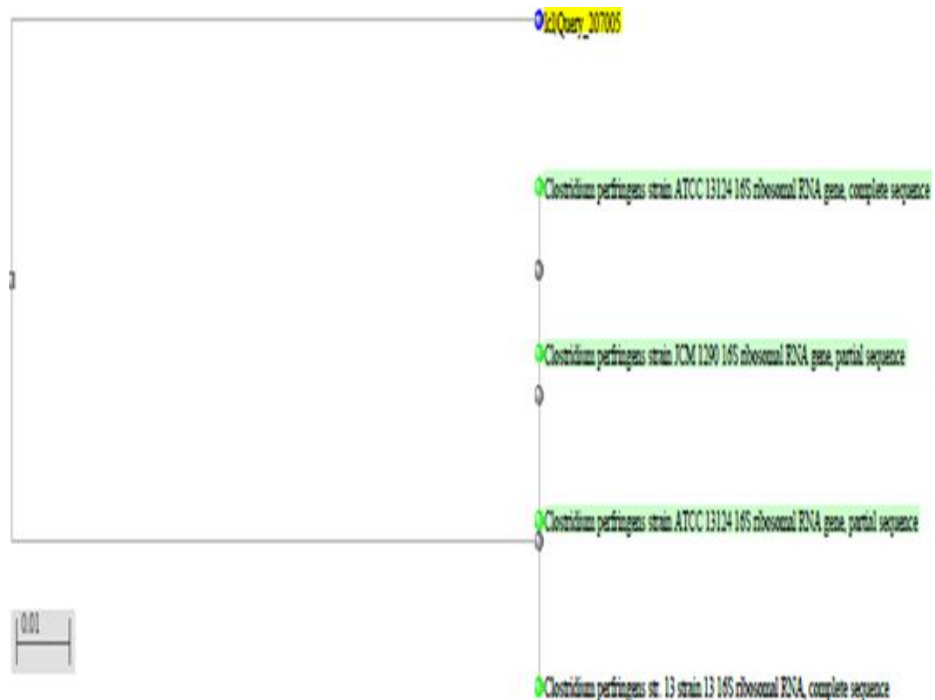
Fig. 3. Phylogenetic Tree of the Molecular Characterization of Clostridium perfringens isolated from Angwan kwara in Keffi

incubation of 96 hours. Fermentation parameters and type of fermentation substrate play an important role in production of bio-butanol. It was observed that there was high production of bio-