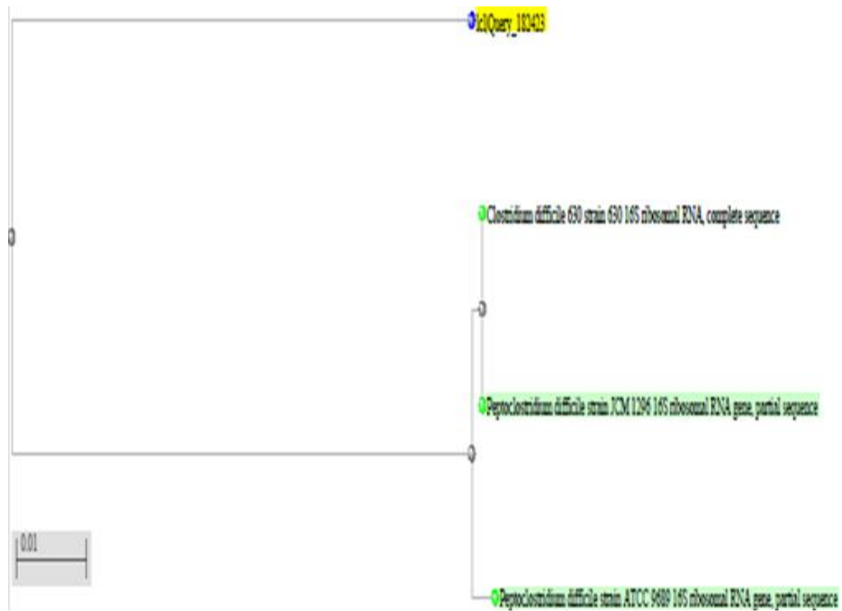
Fig. 2. Phylogenetic Tree of the Molecular Characterization of Clostridium difficile isolated from Angwan Jaba in Keffi