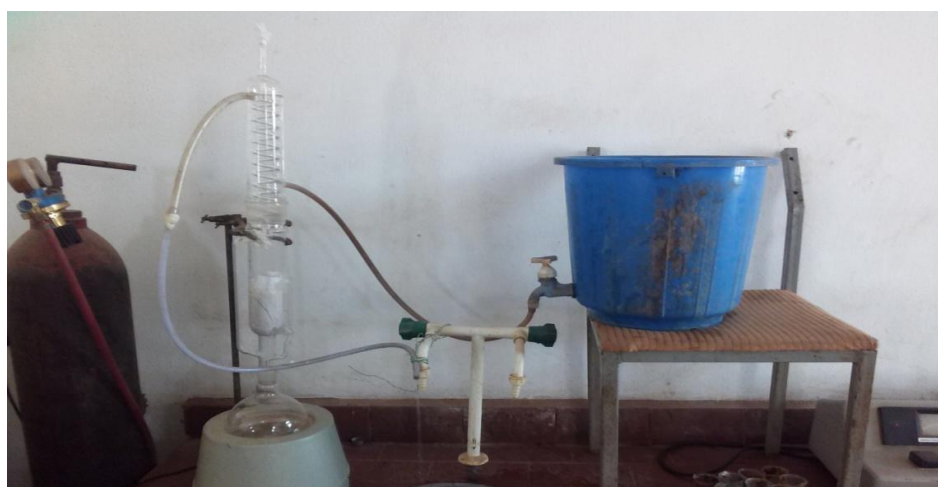
Fig. 1. A set up for the extraction of CSO

The flash point of the CSO and lubricating oil were each determined by heating a cup holding the oil and moving a flame over the oil at regular temperature, starting with a temperature of 28°C below the expected flash point of the oil. The bulb of the thermometer was immersed in the sample in order to allow monitoring and reading of the temperature at flash point. The flash occurred in the cup containing the CSO when the temperature of the oil had reached its flash point [7].