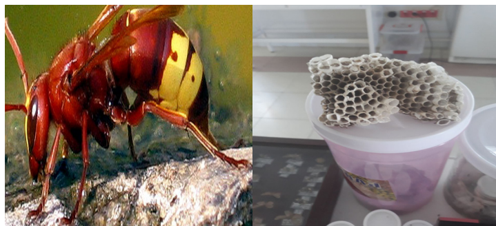
Figure 5. Vespa orientalis (Linnaeus, 1771)

Description. Body length 29-32mm (♀♀), 23-31mm (♂♂), Body length worker is 22-26mm. The number of male mustache segments is 13, and the females always 12 (Figure 6). The head is reddish-brown, the face is yellow. Her chest is brown. Most of the abdomen is brown, and the third and third segments are yellow. Each segment has 2 brown spots on the yellow background. Whiskers and feet are reddish-brown, and the hind legs and feet are more or less yellow. According to Israeli and British scientists, xantopretin spots on the yellowish part of the Vespa orientalis in the abdomen have absorbed the sun's rays and converted them into electricity. So these pumpkin bees are very active on sunny days.