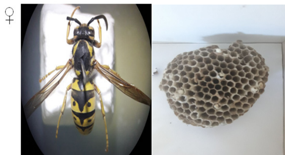
Figure 4. Vespa germanica (Fabricius, 1793)