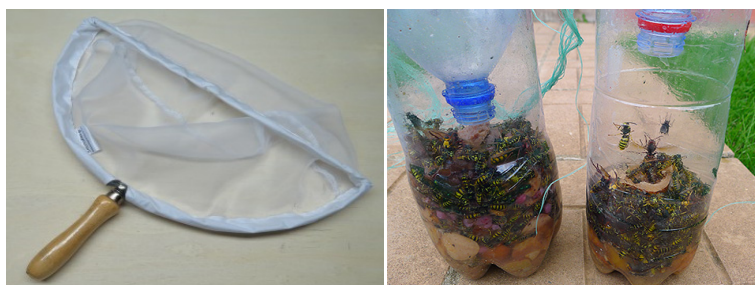
Figure 2. Entomological net and insect trap

The traditional method of collecting materials was entomological net, Mericle molding vessels (Golub, 2012; Moericke, 1951) (Figure 2). During the study, more than 1,000 bees of 5 species were caught. Specification of the species composition of the Vespidae bees was used by comparative charts of foreign scientists and the insect catalog (Stephen & Marshall, 2006).