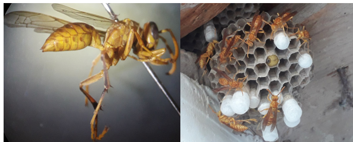
Figure 5. Polistes wattii (Cameron, 1900)