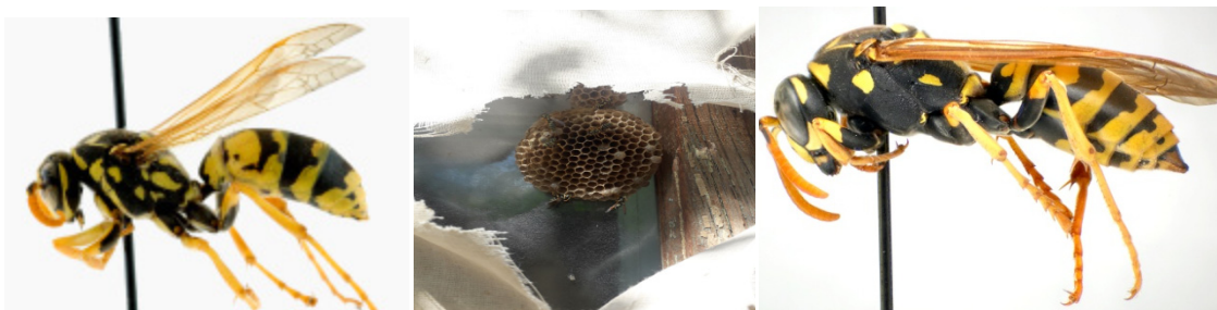
Figure 3. Polistes dominula (Christ, 1791)

Description. The color is dominated by yellow. Antennae yellow, except for the first three segments. The pattern on the clypeus is variable: in the form of a transverse strip or a speck. Mandibles are black. Abdomen without long spaced hairs, fusiform. 1st tergite to base gradually narrowed, not abrupt. The 6th sternite of the abdomen of females is yellow or black only at the base. The color of the abdomen is dominated by yellow. The hind wings in the main part are not narrow. The introduction and rapid spread of P. dominula in Khorezm region has spawned a series of investigations on its biology. P. dominula has become much more abundant in urban and suburban areas. Fore wing length 9.0-12.5mm (♀♀), 8.0-11.5 (♂♂). (Figure 3).