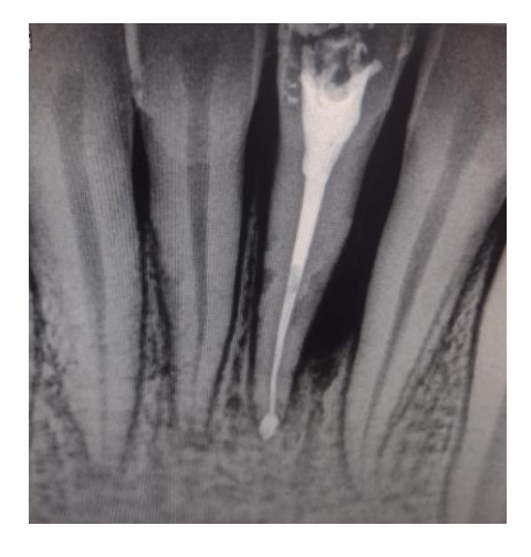
Fig. 3. 1 week after intra canal medicament (metapex) placement

healing is appreciated in this case. Composite wire splinting is the widely used splint method in dental practice, accounting for its advantages such as easy accessibility, simple procedure, can be constructed using the materials available in regular dental practice. It is an inexpensive, flexible splint that allows the physiologic mobility of the teeth and do not require complicated steps to fabricate. Its disadvantage is that it requires an acid etching of the teeth to be splinted [8].