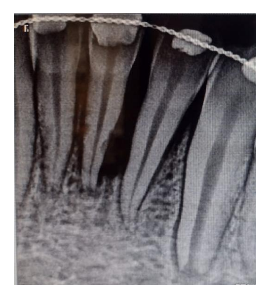
Fig. 2. 1-week follow up showing negative outcome with external root resorption

apical foramen to periapical region, causing apical periodontitis [6]. As a consequence of the inflammatory process. osteoclasts (boneresorbing cells) are activated thus causing bone resorption. Further, the bacterial toxins from the infected pulp spread along the dentinal tubules and activates the clastic cells with resultant damage to the periodontal ligament and resorption of the external root surface. The inflammatory root external resorption is particularly seen after luxation injury, followed by the combined injuries of dental pulp and cementum [6]. Root resorption is generally selflimiting and no treatment is required [7].