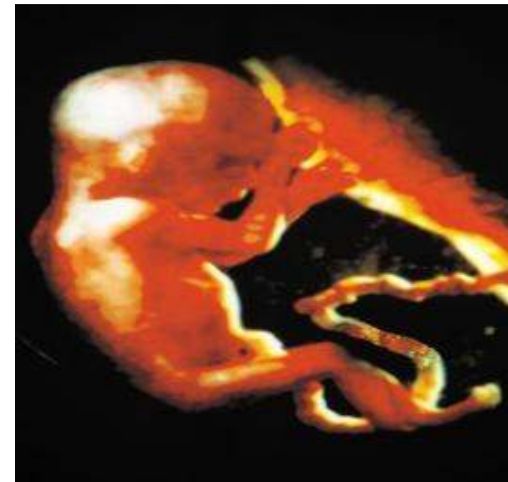
Fig. 2. Umbilical cord stem cells